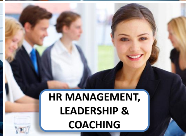
HR MANAGEMENT, LEADERSHIP & COACHING