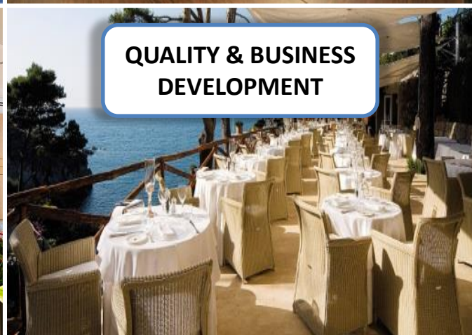
QUALITY & BUSINESS DEVELOPMENT