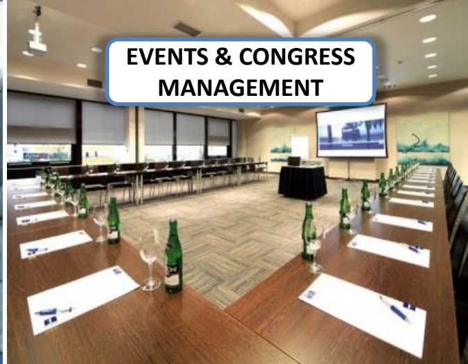
EVENTS & CONGRESS MANAGEMENT