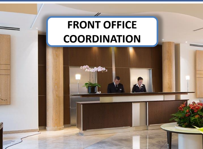
FRONT OFFICE COORDINATION