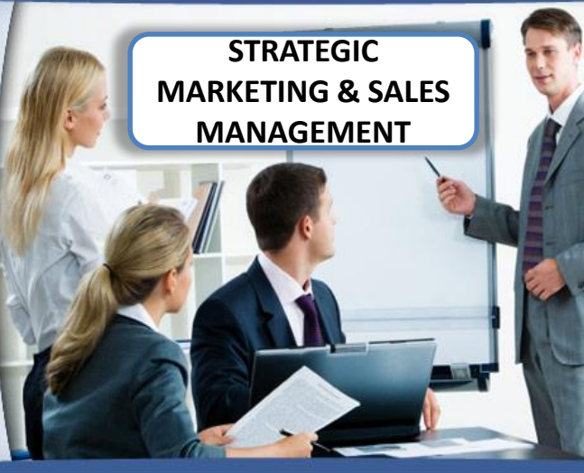
STRATEGIC MARKETING & SALES MANAGEMENT