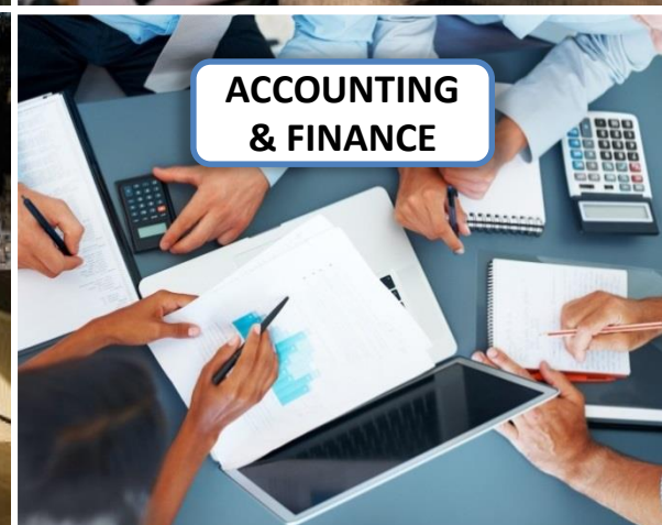
ACCOUNTING & FINANCE