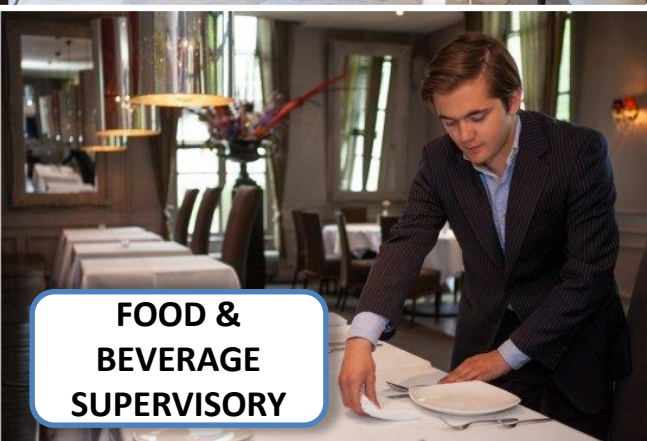
FOOD & BEVERAGE SUPERVISORY