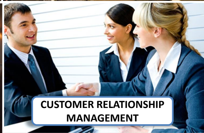
CUSTOMER RELATIONSHIP MANAGEMENT